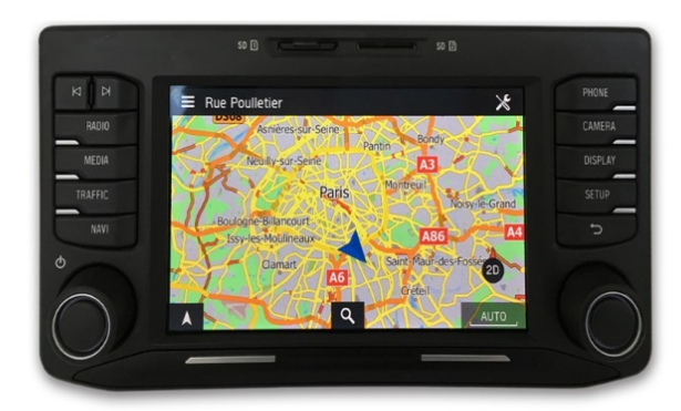
On-board TPEG DAB services