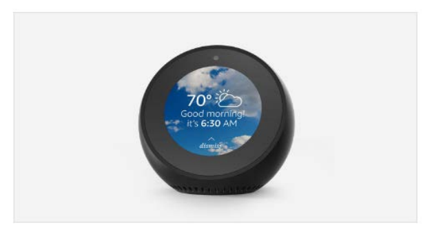
Amazon Echo Spot (2.5" screen): $129