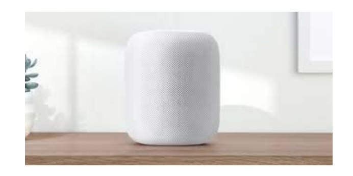
Apple HomePod: $499