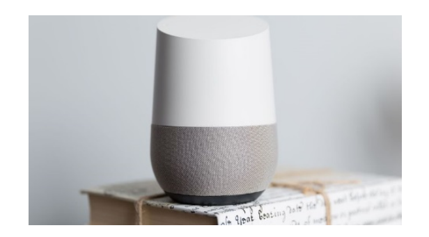
Google Home: $129