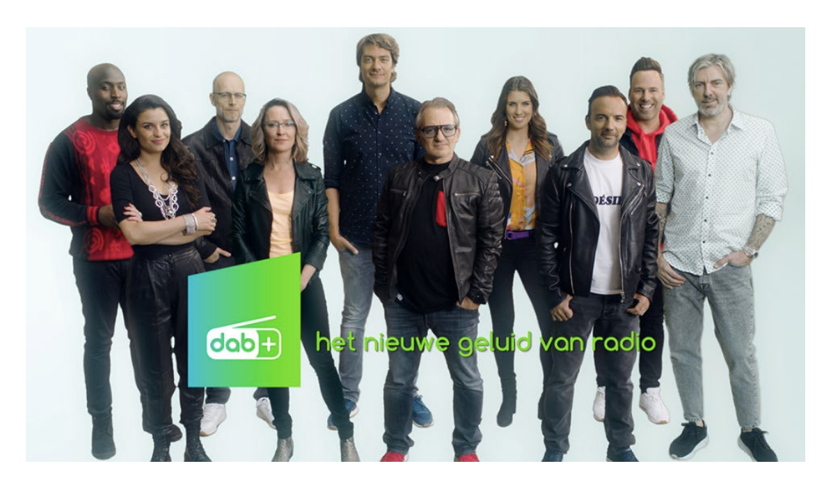
these 10 famous Dutch DJ's/presenters from public & private channels