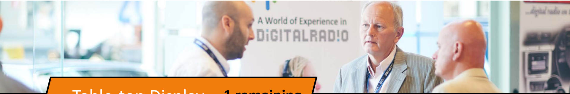
Table-top Display 1 remaining